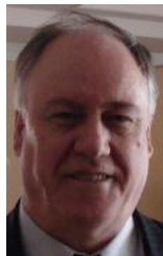
Vassile Scorpan Ministry of Environment, Climate Change Office